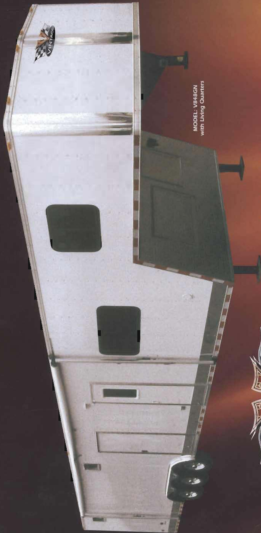
MODEL: V848GN with Living Quarters