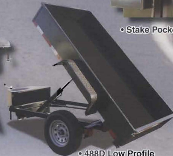
• 488D Low Profile