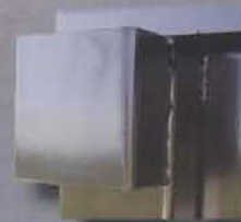
• Stake Pockets