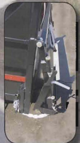
• Split / Spreader Gate