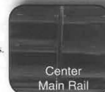
Center Main Rail