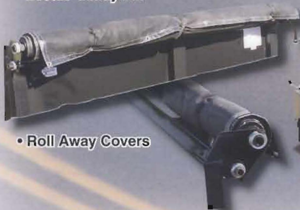
• Roll Away Covers